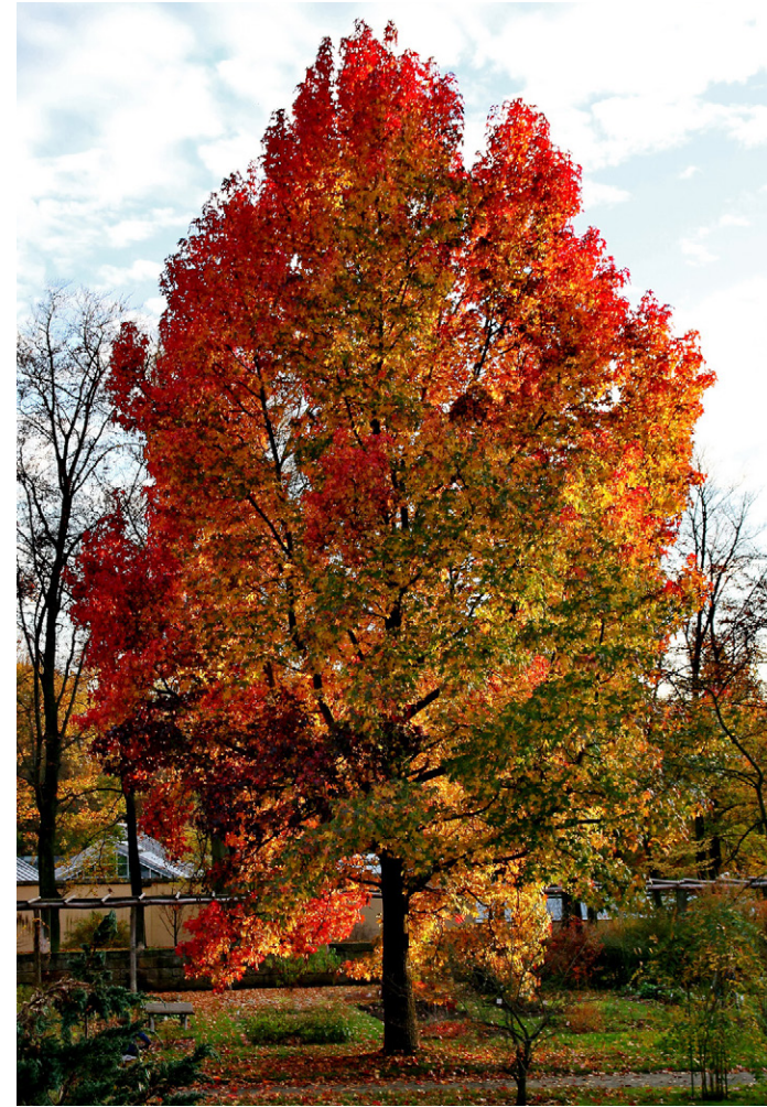
Liquidambar styraciflua - Sweetgum