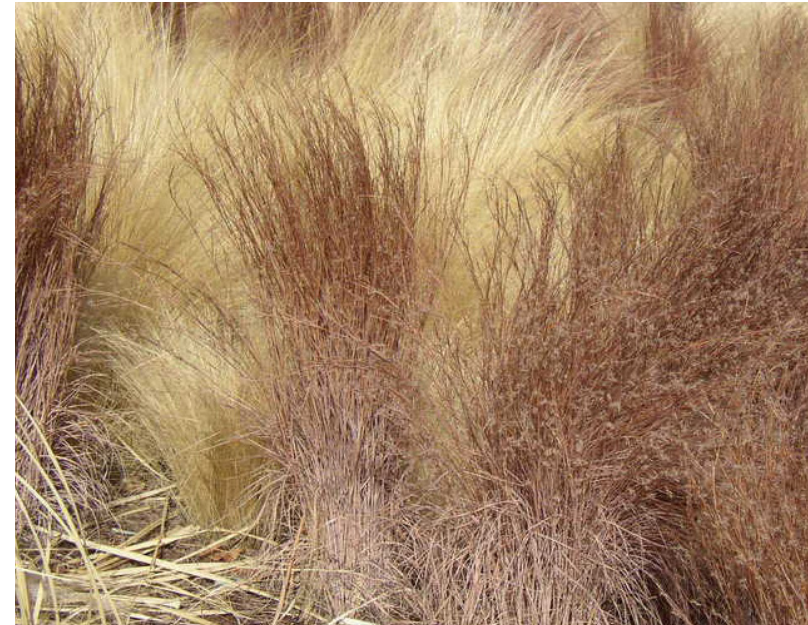
Schizachyrium Blue Stem