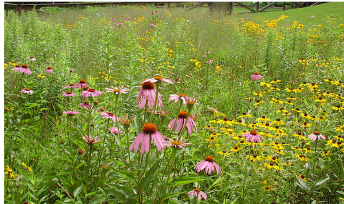
Black-Eyed Susans and Purple Cone Flower

Note: Plantings identified here are not exact representations of proposed site plantings. These images are shown to provide general character of site plantings.