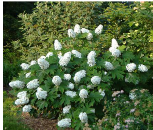
Oak Leaf Hydrangea