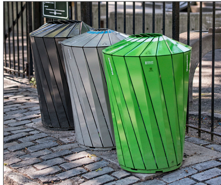
Streetscape/Urban Trash Receptacle