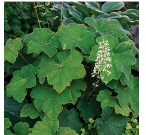
Autumn Bride Heuchera

Note: Plantings identified here are not exact representations of proposed site plantings. These images are shown to provide general character of site plantings.