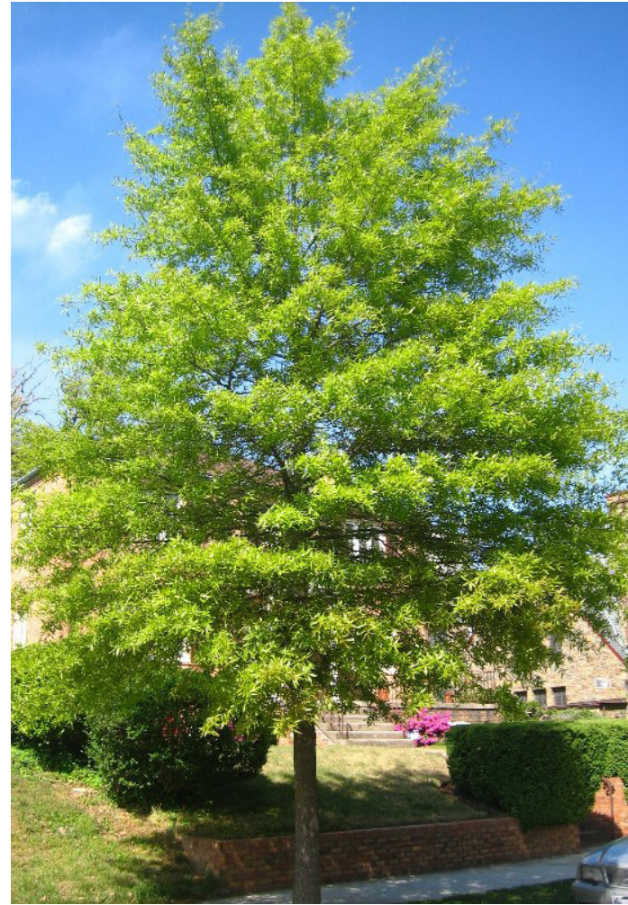
Quercus phellos - Willow Oak