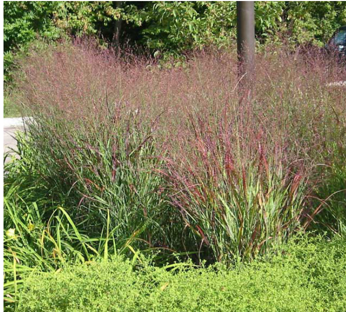
Shenandoah Switch Grass