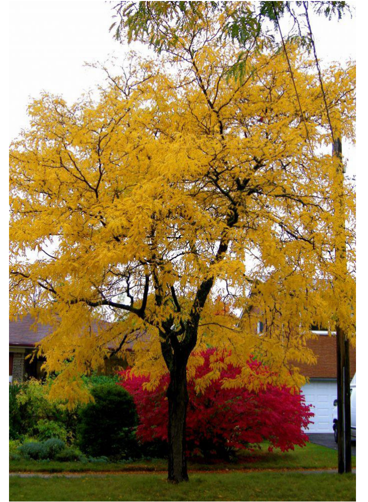
Gleditsia triacanthos - Honey Locust