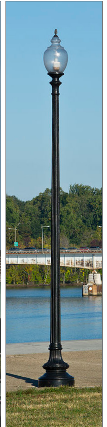
Street Light Option

Note: Site Furnishings identified here are not exact representations of proposed site elements. These images are shown to provide general character of site features.