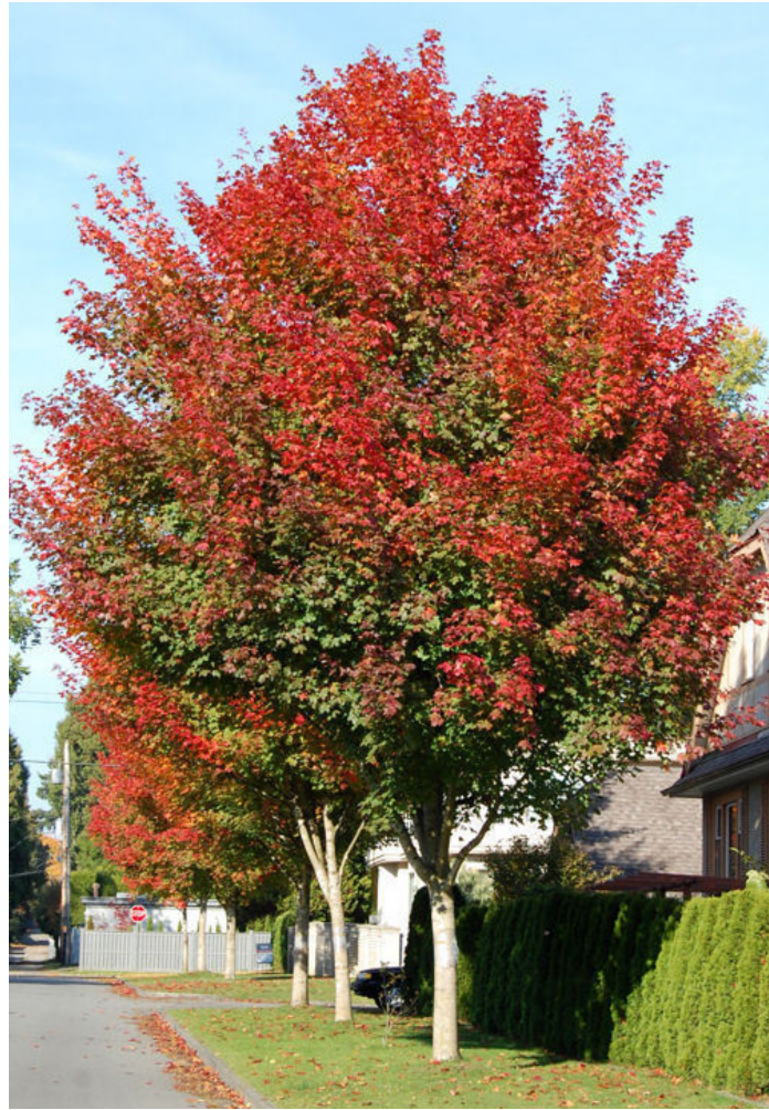
Acer rubra - Red Maple