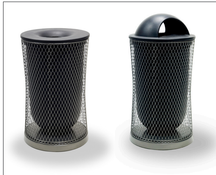
Park Trash Receptacle